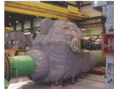
16" x 18" Centrifugal Pump Design: LT450A-TT-1.5" Thick 6.0dBA Reduction

Blanket construction shall be a double sewn lock stitch with a minimum of 7 stitches per inch. Raw jacket edges will have a tri-fold PTFE Teflon® cloth binding. No raw cut jacket edge will be exposed. Stitching will be done with pure Teflon® thread.