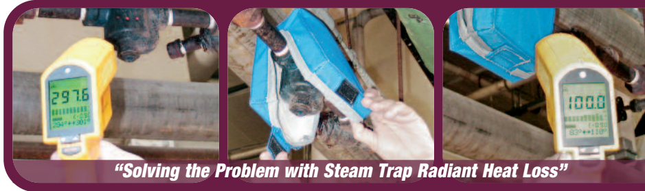
"Solving the Problem with Steam Trap Radiant Heat Loss"

INSULTECH® Heat Shield Design: LT500HS - 1/4" thickness Fastener: Velcro Flaps